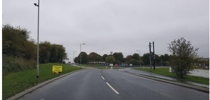
Traffic lights will be placed here

The Packway will have manually controlled traffic lights between 0930 and 1500 to control traffic as it approaches the area of works and reduce the traffic to one lane to maintain a safe working area while the damaged kerbs are being replaced.