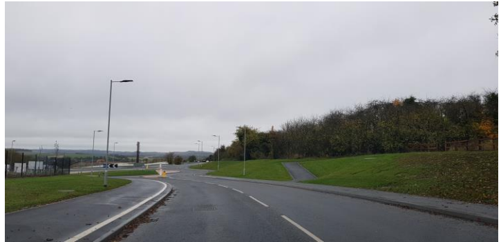
Traffic lights will be placed here