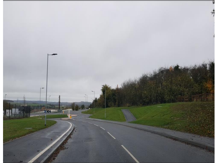
The spur road leading to St Michael's School

Traffic Management will involve the use of manually controlled traffic signals, on weekdays only during 0930 and 1630h on the Packway and at the Junction of Wood Road.