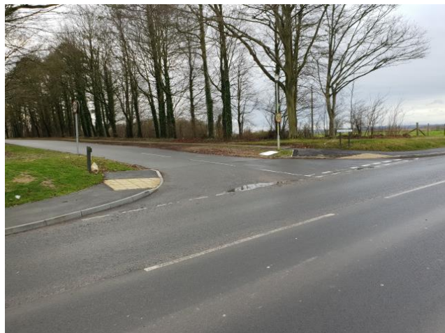
The Packway Junction with Wood Road

The work is planned to take place between 18 and 22 Feb 19 to coincide with the half term closure of St Michael's School. The spur road leading to St Michael's school will also be closed to allow installation of a new footpath to the school.