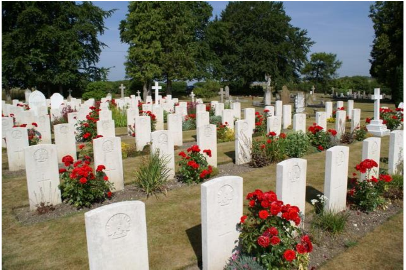
Durrington Cemetery, Wiltshire